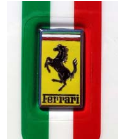
A Proud Heritage!